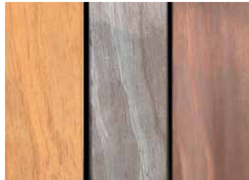
Ticari newly installed

These images show Sicaro Ticari once installed, the same product 2 years later and then washed 3 years after installation without any protective treatment being applied. Please note that after cleaning unprotected product colour will be revealed although the tone will have changed compared to newly installed product. This colour change is determined by environmental factors and will therefore differ from region to region and application to application with exposure to the elements over the product service life.