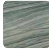
Storno deep silver grey