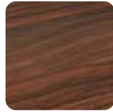
Livada rich brown rosewood