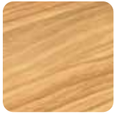
Cerdin light bright maple