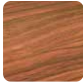
Estera earthy red cedar