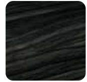
Azarac dark strong ebony